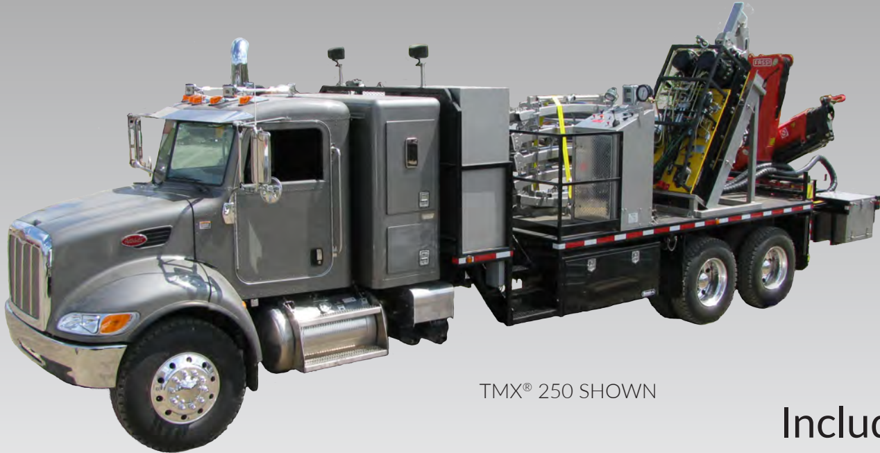
TMX ® 250 SHOWN